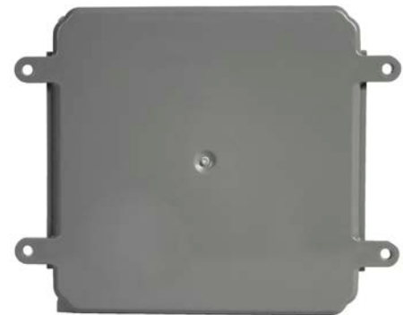
Back side - with mounting tabs.

Specifications: 6.25" (159 mm) W x 6.25" (159 mm) D x 4.375" (112 mm) H * 5.7 lbs (2.6 kg)