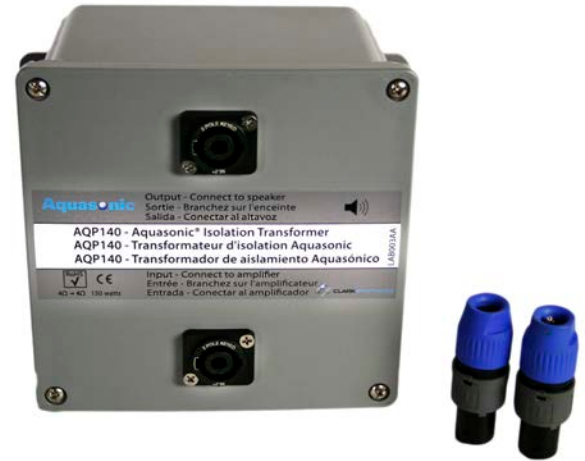
Isolation transformer with two speakon connectors.

The Clark Synthesis Isolation Transformer comes installed with two Neutrik® Speakon® connectors (not cheap substitutes) and includes two Neutrik® Speakon® connectors for easy connection to amplifier and speaker wiring.