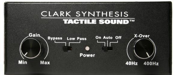
Wired Remote Control Interface 5 in W (127 mm) x 2.125 in H (54 mm) x 2 in D (50 mm)

Clark Synthesis Professional Transducers were originally developed for military simulation devices to transfer explosions, gunshots, and other sounds into a tactile experience that can be felt as well as heard. What is now our Full Contact Audio ® product line was enthusiastically received by the home theater industry and video gaming community.